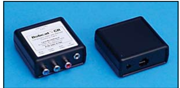
Component Video and Remote Control on Cat 5/6

PN L40-0191: Receive unit with plug in for power to the IR receiver