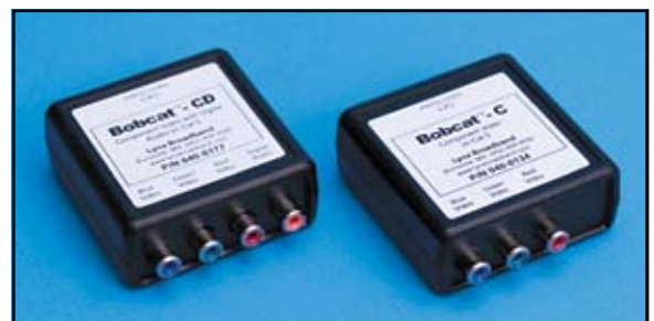
Component Video on Cat 5/6 with or without Digital Audio