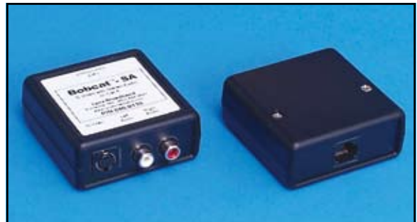
S-Video and Stereo Audio on Cat 5/6 Cable