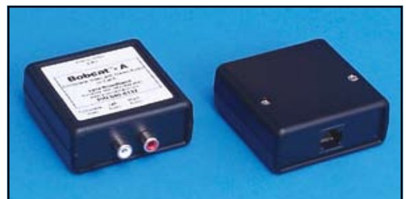
Stereo Audio on Cat 5/6

Bobcat™-CD: Delivers component video and digital audio on Cat 5 or Cat 6 cable. Excellent for sending HD programming from a cable or satellite set top box (or DVD) to a remote TV or projector. Distances to 200 feet with standard Cat 5/6 cable (330 feet with low skew cable).