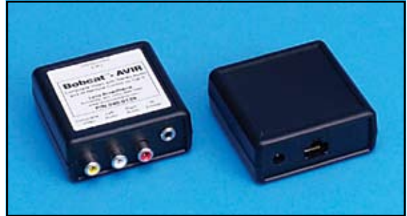
Composite Video, Stereo Audio, and Remote Control on Cat 5/6