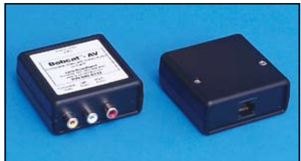
Composite Video and Stereo Audio, on Cat 5/6 Cable